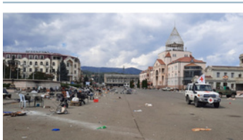
Why Are There No Armenians In Nagorno-Karabakh? Fact-Finding Report